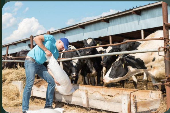
1. uncle Tom/ on a farm